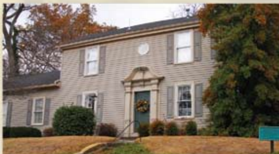
This federal style home was built around 1841. A Newburgh Walking Tour Guide is available in print form or online.

The hustle and bustle that shaped so many generations here has faded with the advent of faster, more efficient modes of transportation, but the charm, quaintness and hospitality remain.