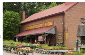
224 West Jennings Street

The church was dedicated in July 1867, with about thirty families attending. A white bell tower rose above the roof with a golden cross atop its spire. In 1952, the church began an expansion program