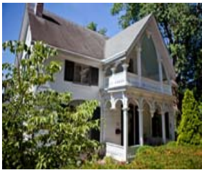
201 West Jennings Street