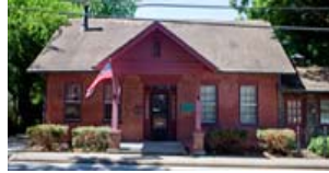
217 West Jennings Street

Built in 1845, this full Colonial Cape Cod is an excellent example of the type of home popular in early Newburgh. Built of locally fired brick, the front porch was added at a much later date.