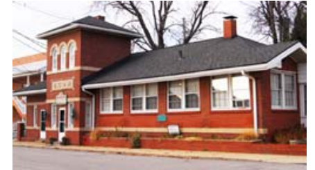
12 East Water St.

The Evansville Suburban and Newburgh Railway Company built this passenger and freight station in 1912. The trains were first operated by steam and later by electricity. In 1930, they were replaced by bus service, and the station became a residence