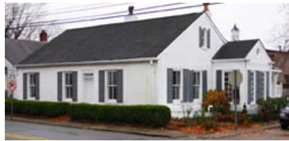
3 Market Street