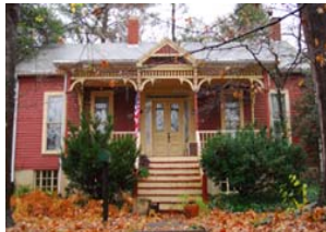
210 West Jennings Street