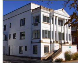
110 Water Street

This building was built prior to the Civil War. In 1917