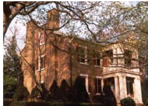
Old Stone House

Built in 1834 by Gaines Head Roberts, the house took three years to complete. Built of sandstone, the stones were brought by river barges and hauled on land by oxcarts to the building site.