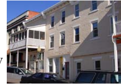
5 State Street

In 1915 this building was constructed by Herman